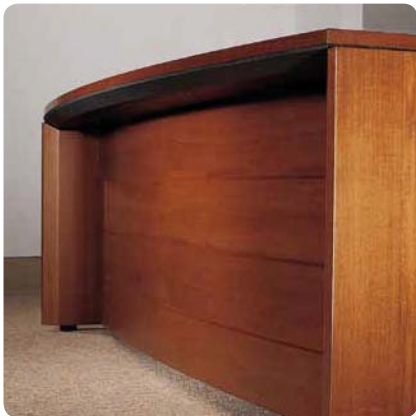
The modesty panel and solid looking side panels employing horizontal lines produce a quality premium look.