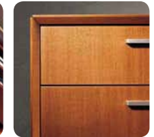
The top and sides are joined at a 45 degree angle to emphasize design.