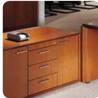
The side cabinet consists of doors and drawers. When it used as a side desk, the work area may be extended.