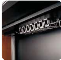
Especially the horizontal & vertical wire duct covers enhance the convenience of wire management.