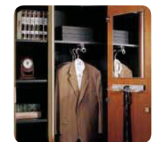
Only the strictly selected accessories have been used such as coat hangers, mirror and necktie hanger for elegant and functional design.