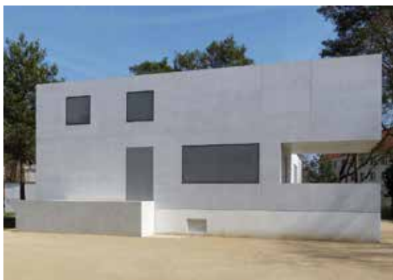
New Masters' Houses in Dessau; Architecture: Bruno Fioretti Marquez Architects; performance: Arbeitsgemeinschaft Betonlasur Berlin