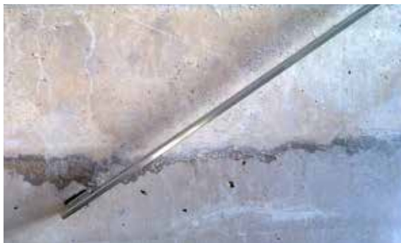
New concrete with defects that need to be refilled