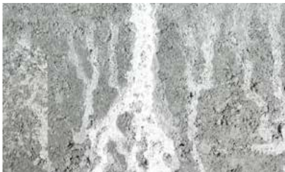
New concrete with severe blemishes