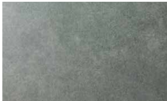
Blemishes either strongly equalised or complete colour-matched mineral finish