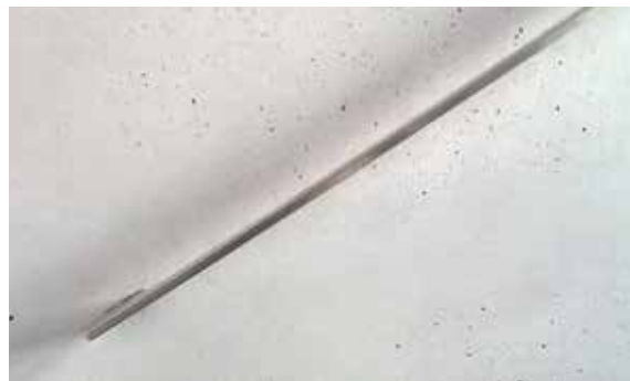
Refilled areas either strongly equalised or complete colour-matched mineral finish