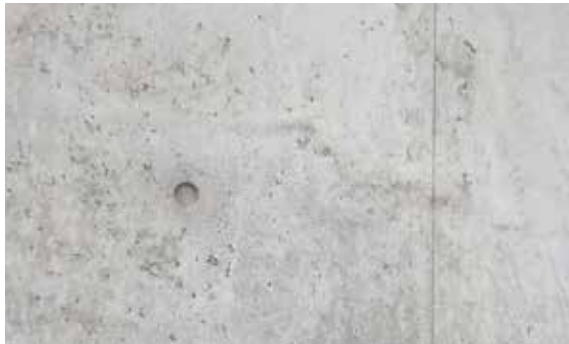
New concrete with slight blemishes