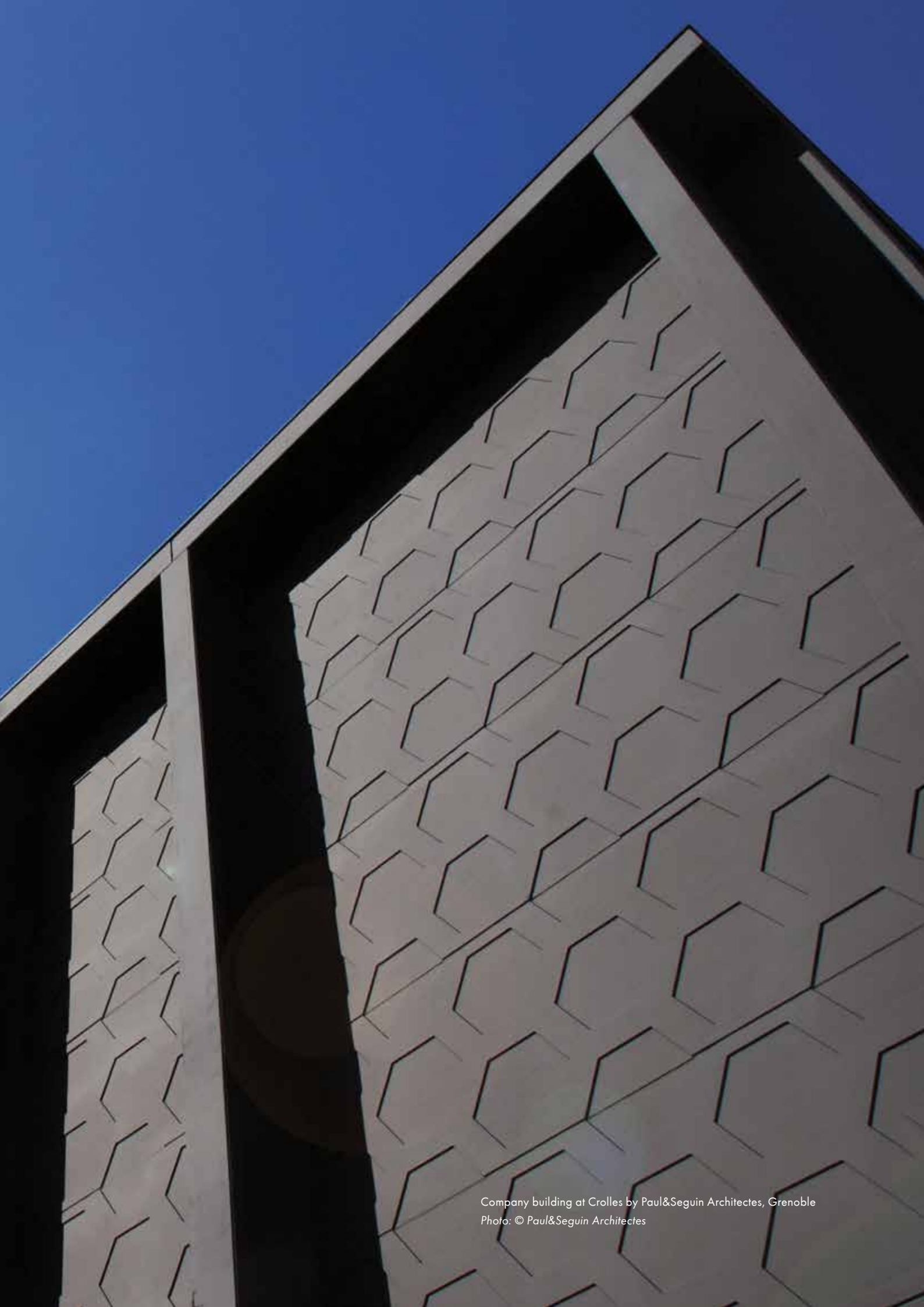
Company building at Crolles by Paul&Seguin Architectes, Grenoble