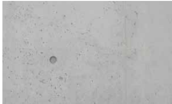
Uniform, mineral surface with KEIM Concretal-Lasur