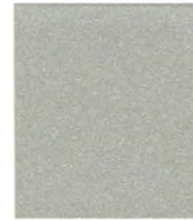
CASHMERE MICA PVDF 2