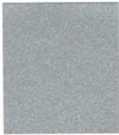
WEST PEWTER PVDF 2