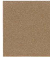
ROMAN BRONZE PVDF 2/SRI 33