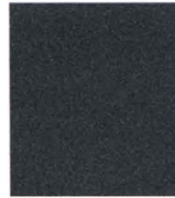
GRAPHITE MICA PVDF 3/SRI 6