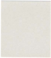
MARKET WHITE PVDF 2