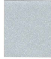
CHERRY SMITH SILVER PVDF 2