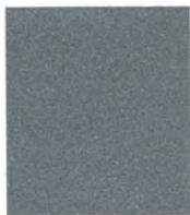
STEEL CITY SILVER PVDF 2/SRI 37