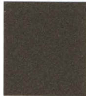
BISTRO BRONZE PVDF 2