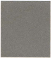
ANODIC BRONZE MICA PVDF 2