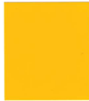
DAYLILLY YELLOW PVDF 2