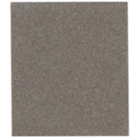
DRIFTWOOD PVDF 2/SRI 40