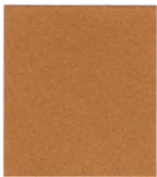
COPPER PENNY PVDF 2