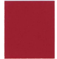
ROASTED RED PEPPER PVDF 3/SRI 41