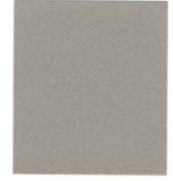
COPPER METALLIC PVDF 3/SRI 35