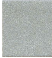
SOUTHWEST GOLD METALLIC PVDF 3