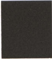
ANODIC DARK BRONZE MICA PVDF 3/SRI 6