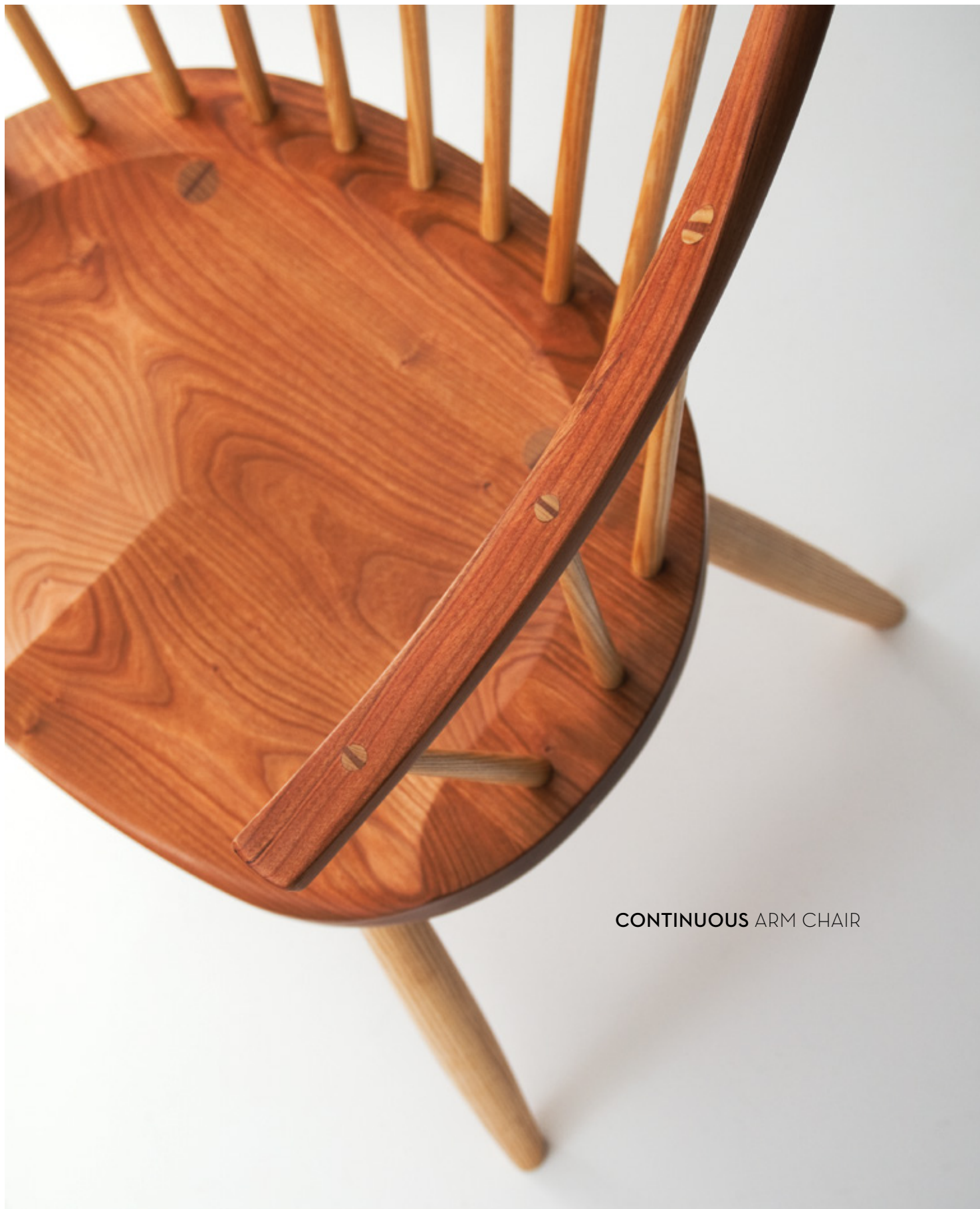
CONTINUOUS ARM CHAIR