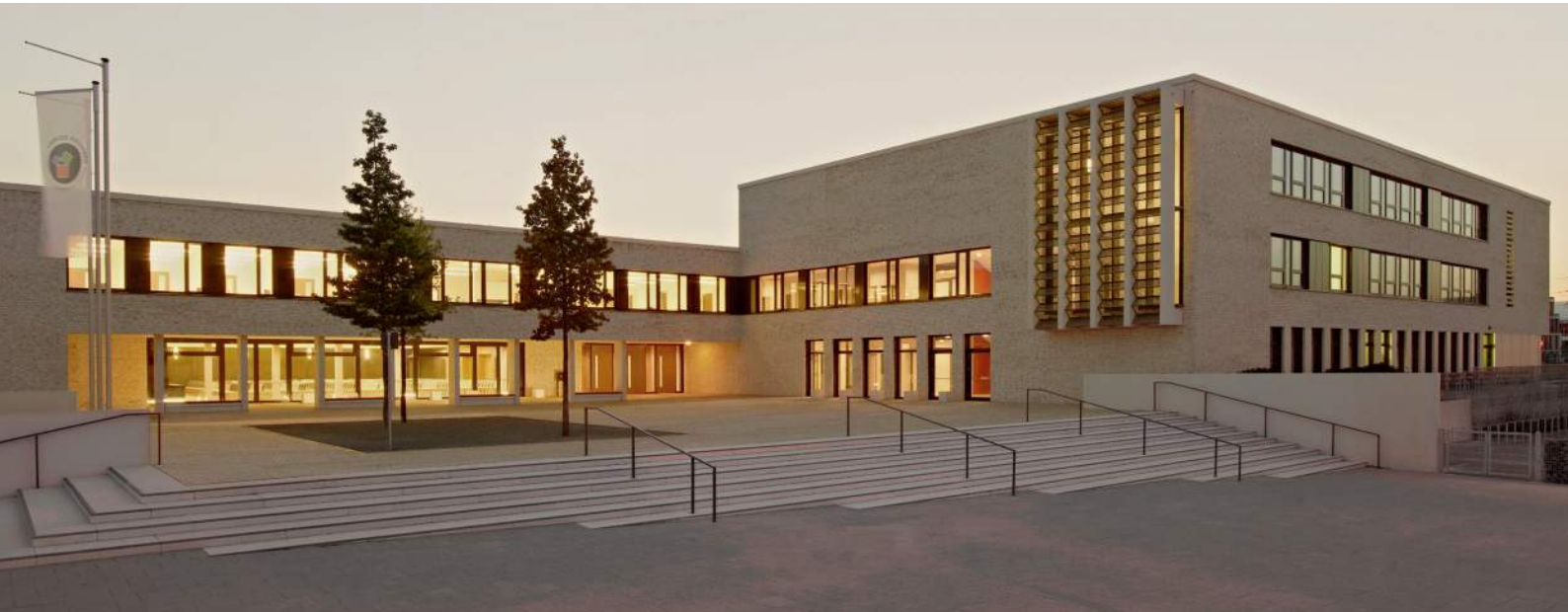
Project: Secondary School Frankfurt Riedberg, Architect: Ackermann+ Raff

Allplan Architecture is a universal BIM planning tool with extensive CAD functionality. You can work flexibly either exclusively in the 3D model or in a combination of 2D and 3D, which is a particular advantage in the working drawings. The strength of Allplan Architecture lies in its high reliability and precision across all planning phases, in particular in the area of quantity takeoff. In conjunction with the products Allplan Design2Cost (cost planning), Allplan Engineering (engineering) and Allplan Allfa (facility management), Allplan Architecture offers integrated solutions for civil engineering. By combining Allplan with the cloud-based BIM platform bim+ you profit from a central model storage, visualization and coordination across office and discipline boundaries. A wide range of interfaces – including the internationally certified IFC interface – ensures system-independent data exchange with planning partners.